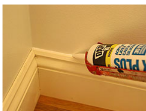
Apply caulk to seal crevices and joints in baseboards and gaps on shelving or cabinets.