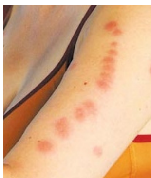
(Left) Unlike mosquito bites, bed bug bites often appear in rows. Welts usually appear immediately, but can take up to 14 days to appear.