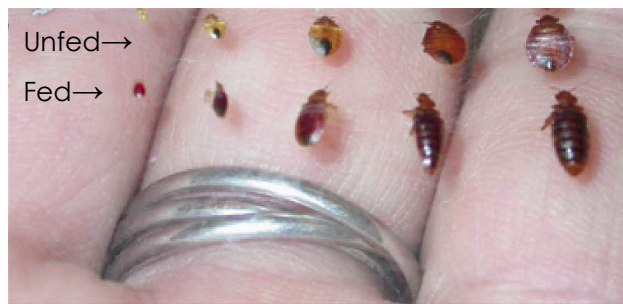
Bed bugs at various stages of growth. Unfed bugs (top row) are lighter in color, shorter, and flatter.