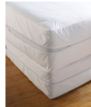
Cover mattresses and box springs with covers made for allergy or bed bug control.