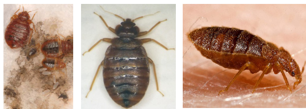
(Above left) Bed bug eggs, nymphs and adult. (Center) Bed bug adult shown about 7 times actual length. (Right) Bed bugs are flat when viewed from the side.